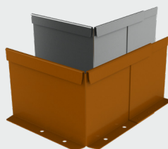
Premanufactured Reverse Corner