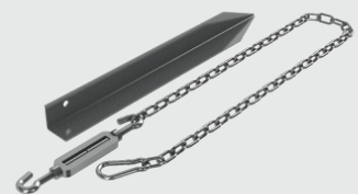
Chain & Spike Brace Kit