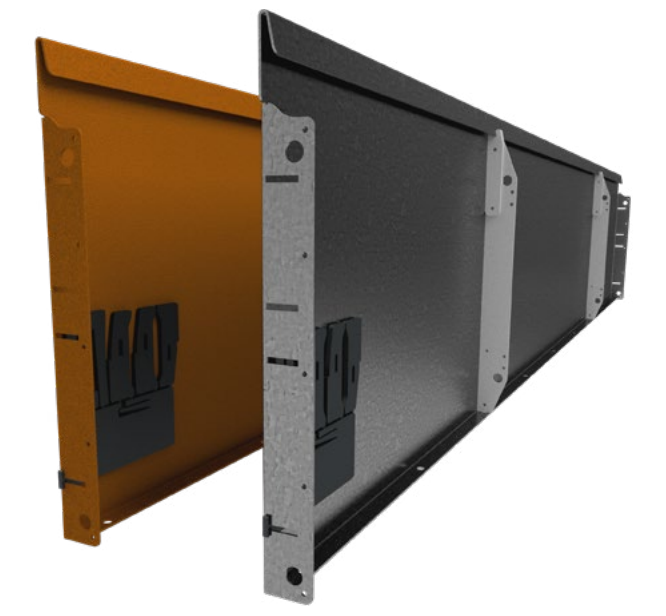
Steel plate thickness 2mm