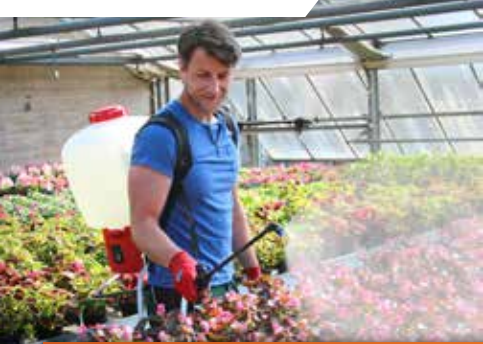
417Li & 417Li-s - Battery Backpack Sprayer